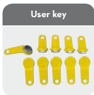
Composed by 10 User yellow key Code F15904000